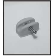
Rear Foot (2) (With Nut & Bolt)